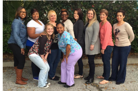
Our Healthy Weight Challenge participants!