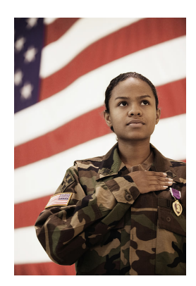
We Thank the Women and Men Who Serve Our Country

Dr. Randolph's Ageless & Wellness Medical Center